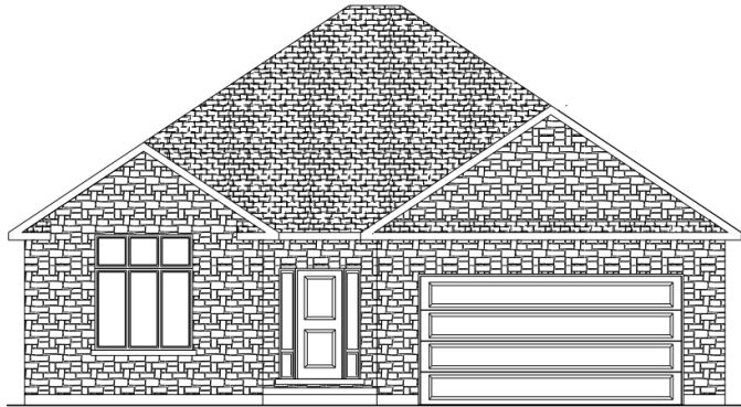
FRONT ELEVATION 'B'