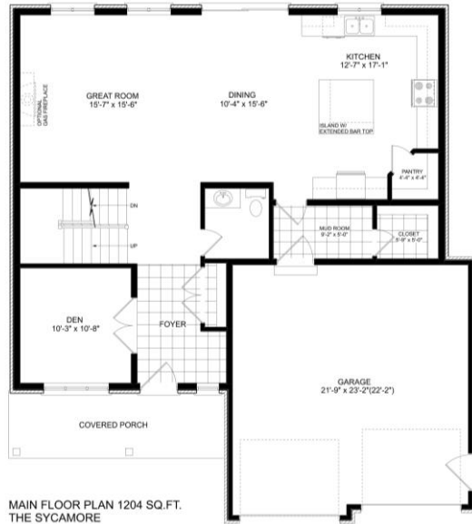
MAIN FLOOR PLAN 1204 SQ.FT. THE SYCAMORE