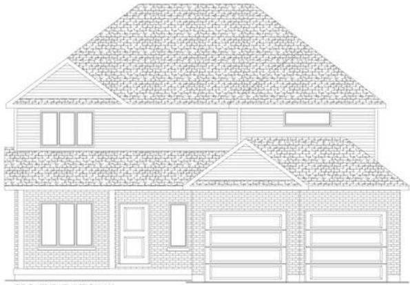
FRONT ELEVATION 'A' THE SYCAMORE