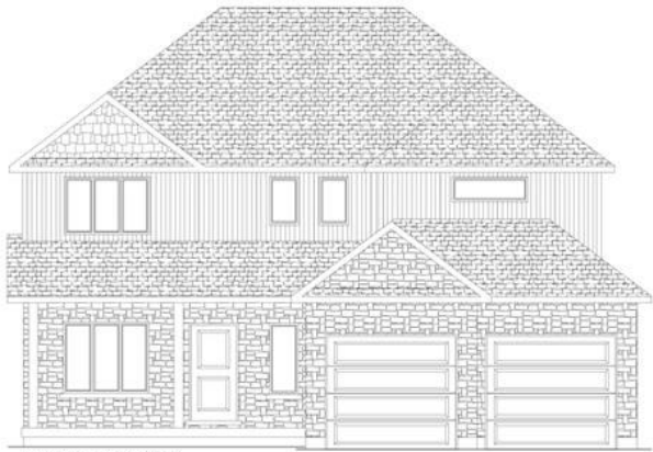
FRONT ELEVATION 'B' THE SYCAMORE