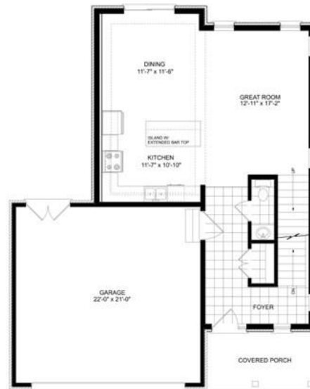
MAIN FLOOR PLAN 815 SQ.FT. THE SPRUCE