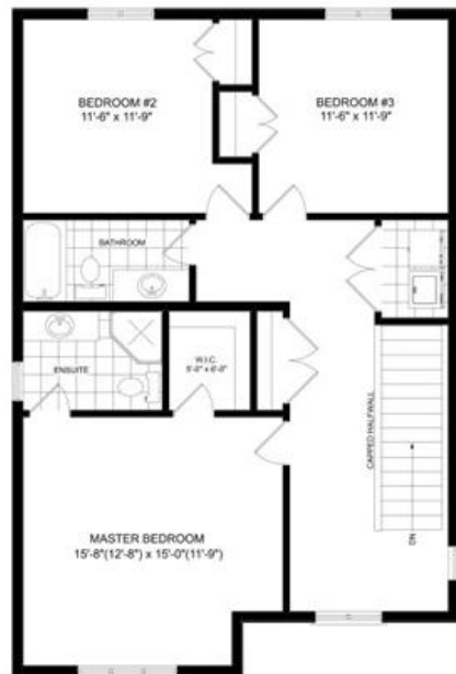
UPPER FLOOR PLAN 1030 SQ.FT. THE SPRUCE