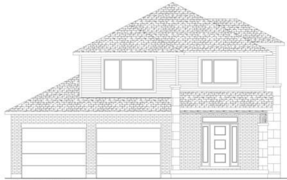
FRONT ELEVATION THE MAGNOLIA