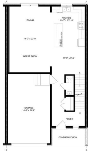
INTERIOR UNIT #11 MAIN FLOOR PLAN 900 SQ.FT.