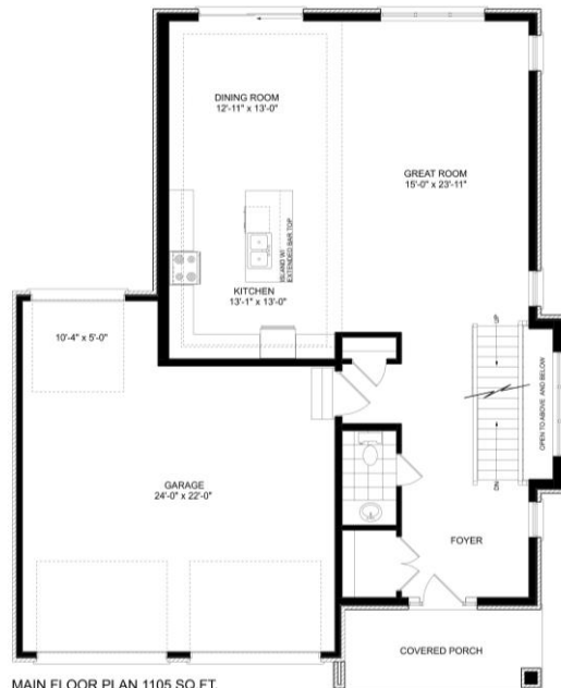
MAIN FLOOR PLAN 1105 SQ.FT.