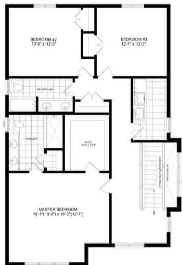
UPPER FLOOR PLAN 1300 SQ.FT.