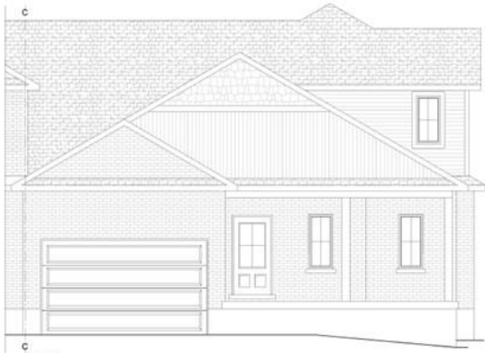
UNIT #13 FRONT ELEVATION