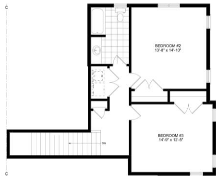
EXTERIOR UNIT #13 UPPER FLOOR PLAN 752 SQ.FT.