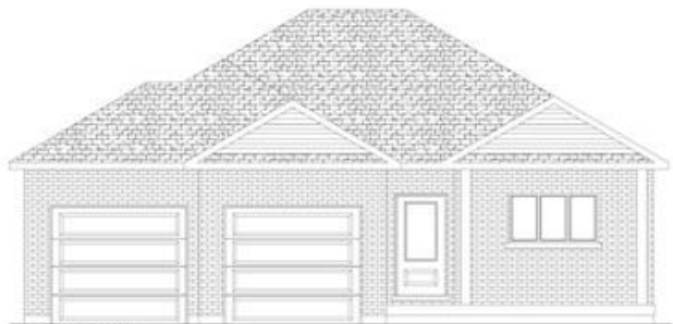
FRONT ELEVATION A' THE ELM