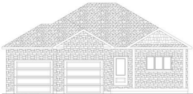
FRONT ELEVATION B' THE ELM