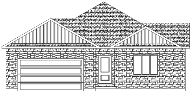
FRONT ELEVATION 'B' THE CEDAR