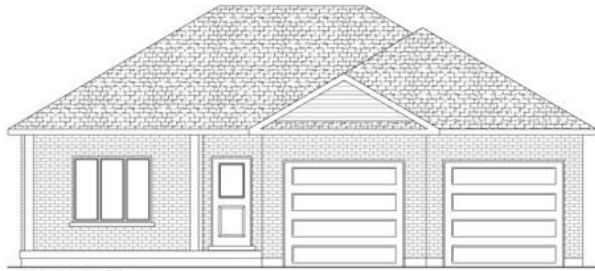
FRONT ELEVATION 'A'