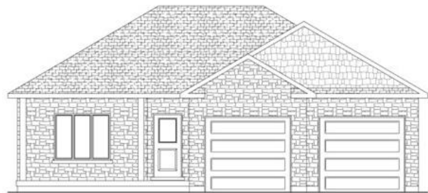
FRONT ELEVATION 'B'