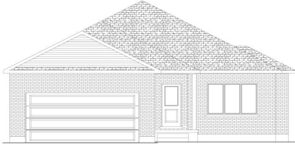
FRONT ELEVATION 'A' THE ASH