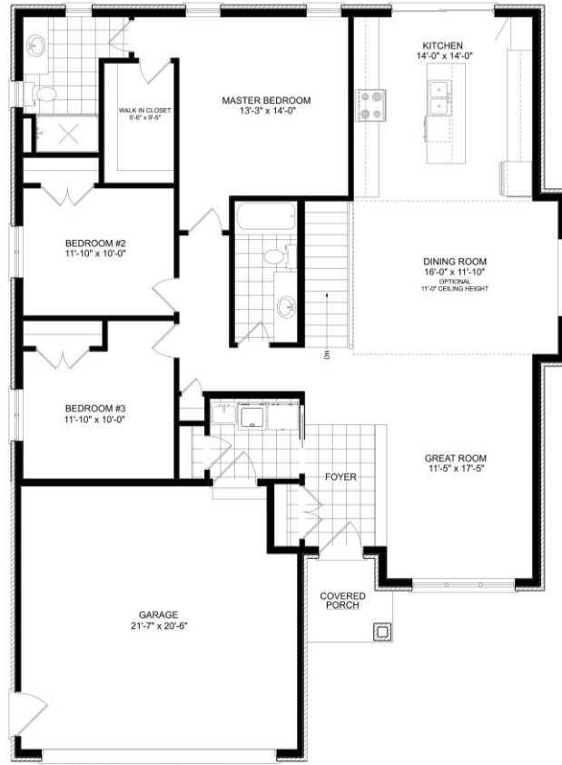
MAIN FLOOR PLAN 1725 SQ.FT. THE ASH