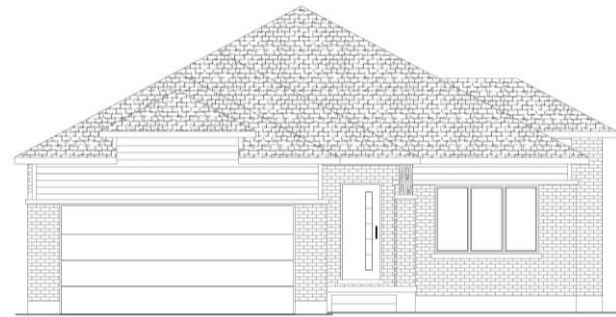
FRONT ELEVATION 'B' THE ASH