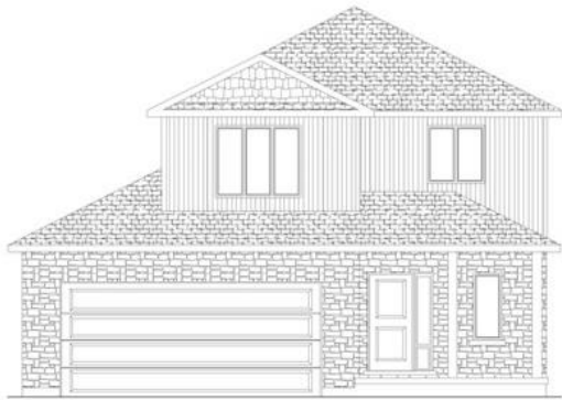
FRONT ELEVATION 'B'