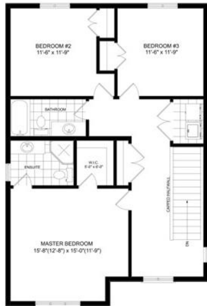
UPPER FLOOR PLAN 1030 SQ.FT.