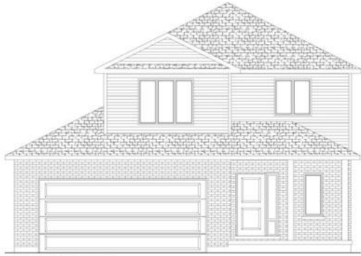
FRONT ELEVATION 'A'