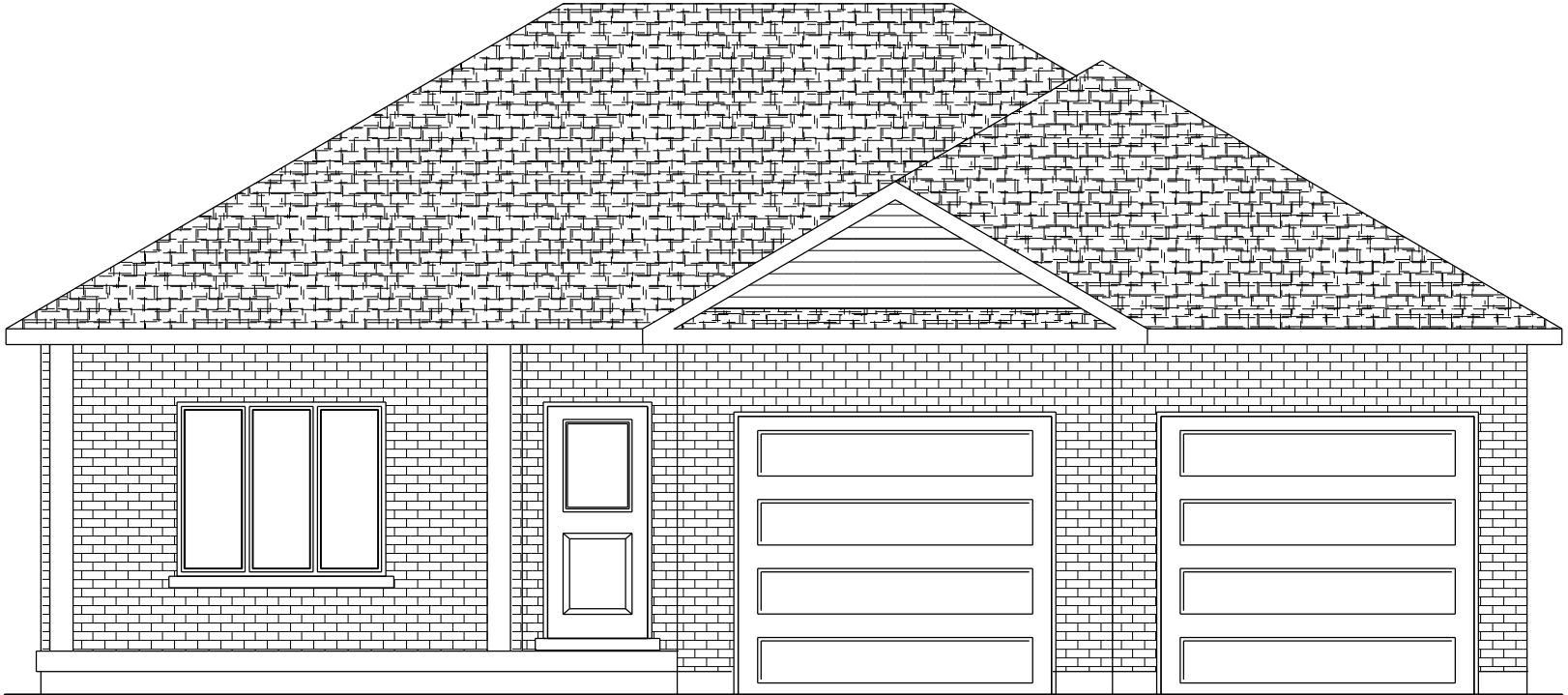
FRONT ELEVATION 'A' THE BIRCH