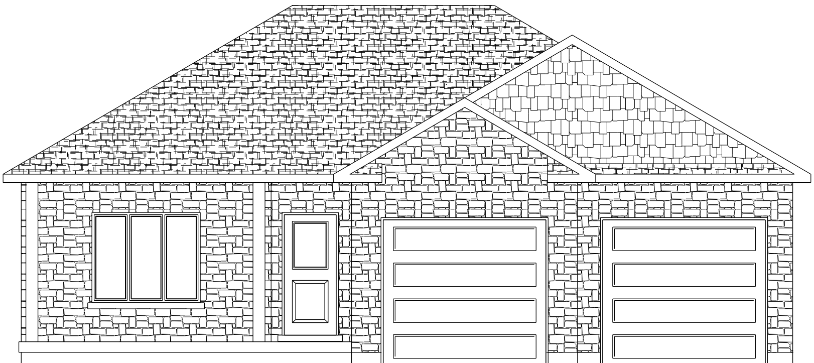
FRONT ELEVATION 'B' THE BIRCH