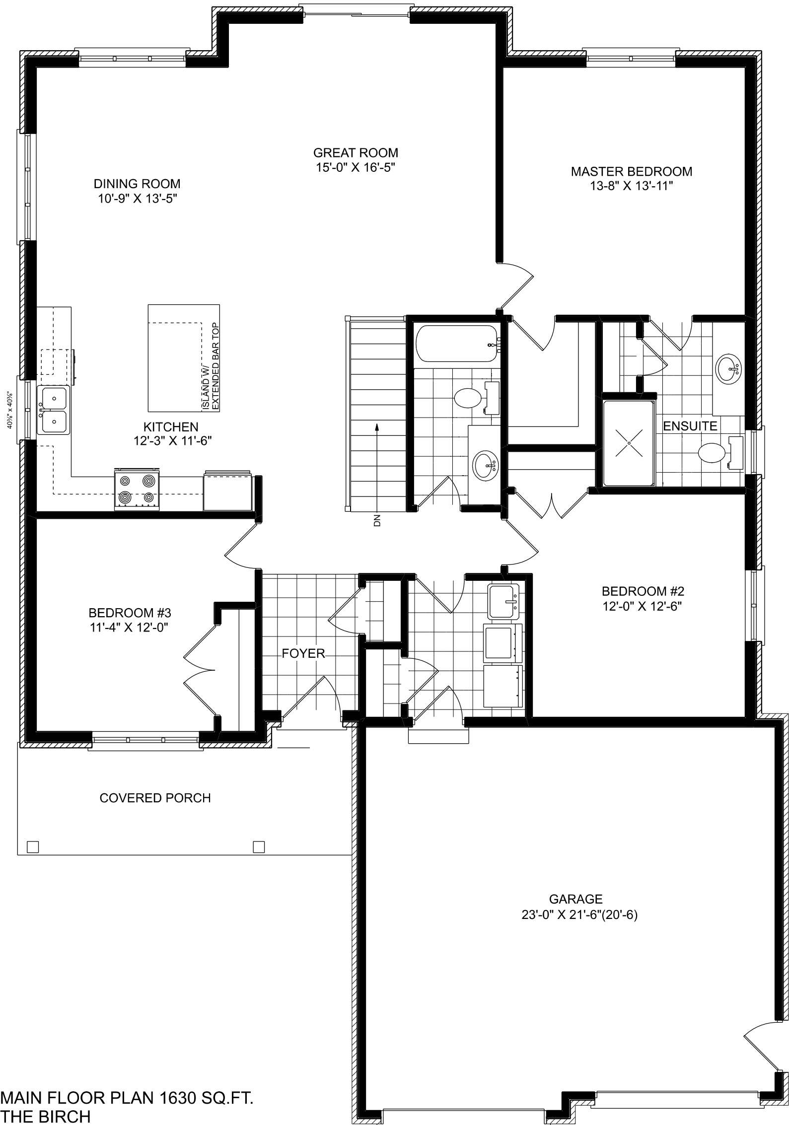
MAIN FLOOR PLAN 1630 SQ.FT. THE BIRCH