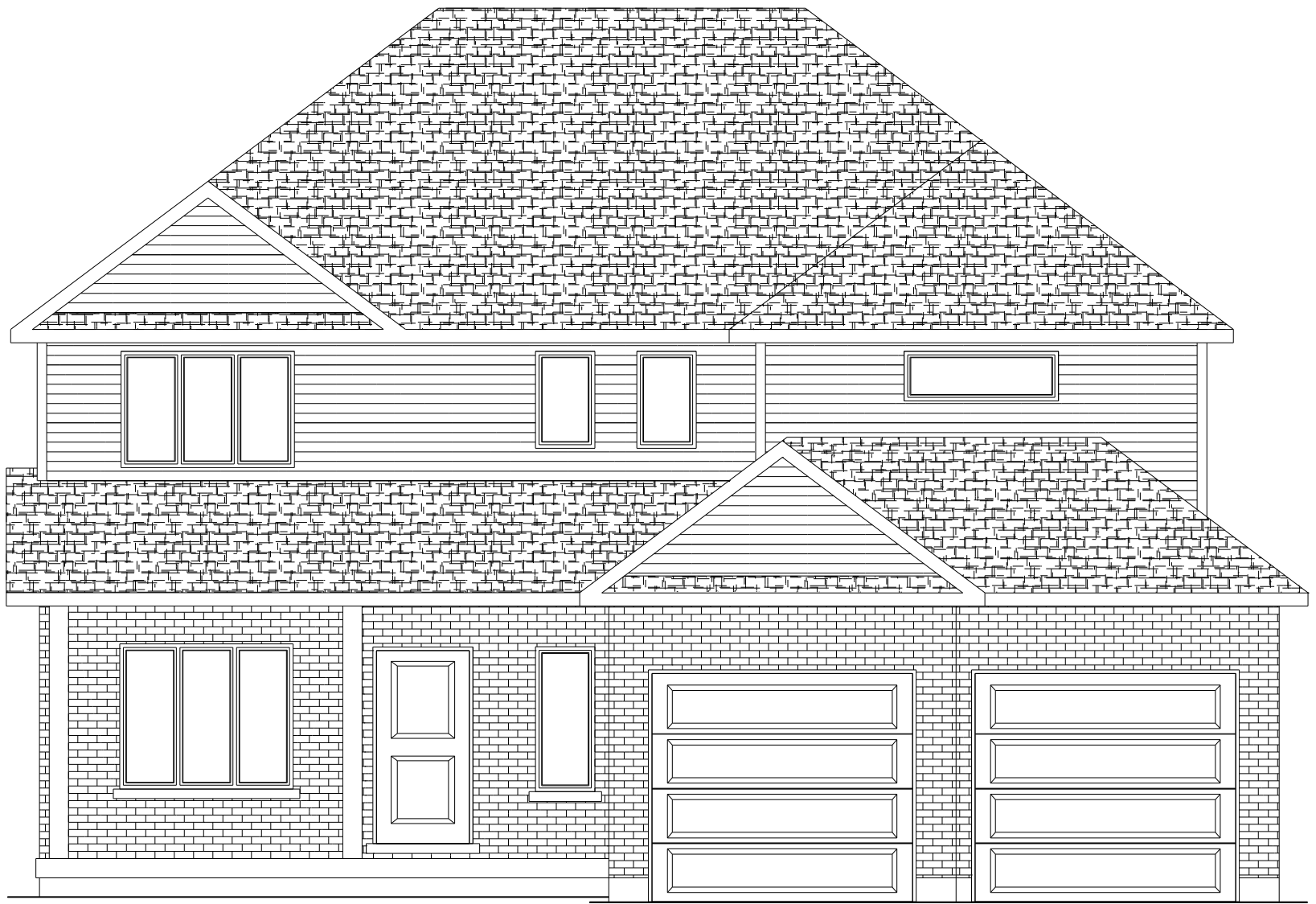
FRONT ELEVATION 'A' THE SYCAMORE