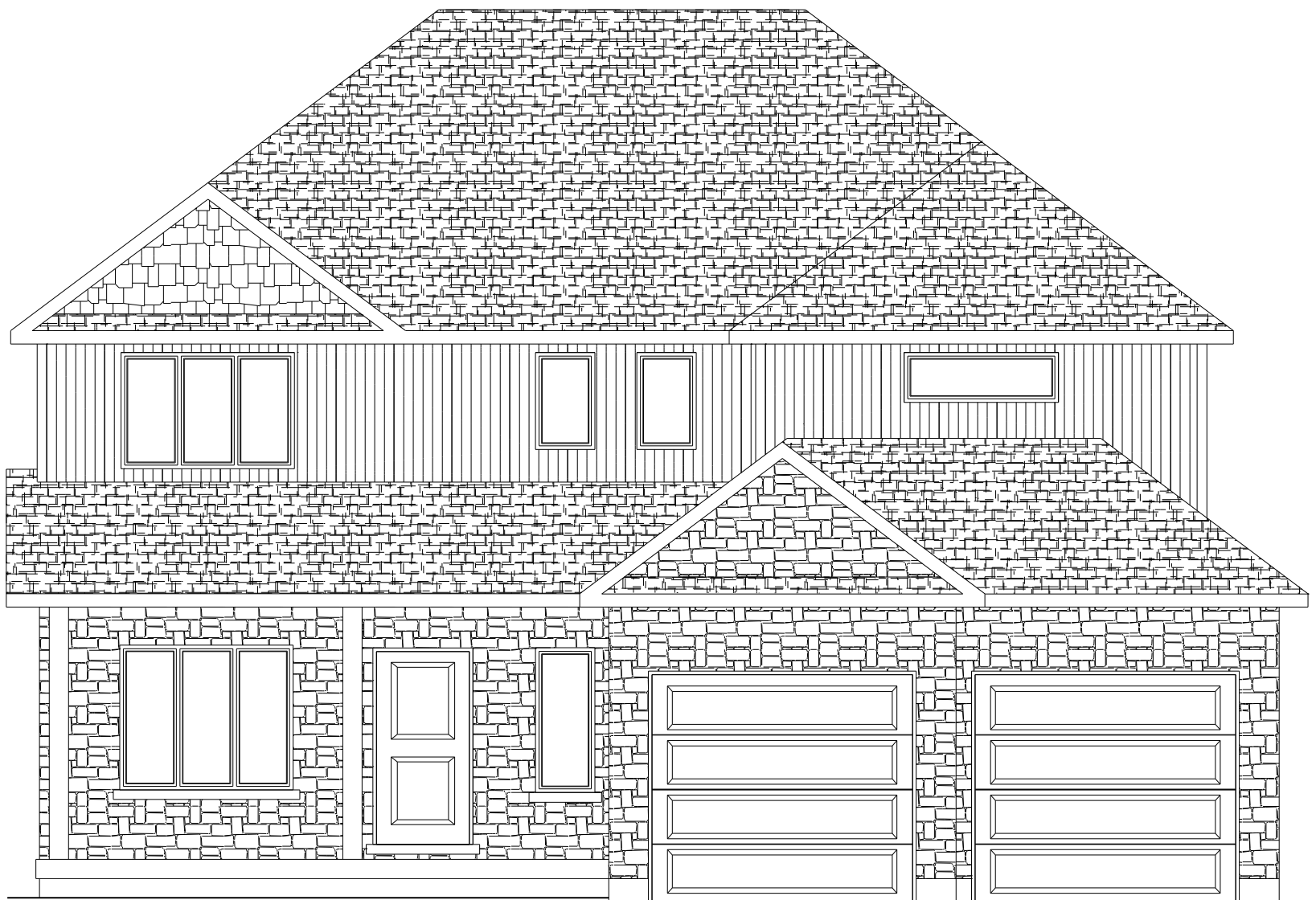
FRONT ELEVATION 'B' THE SYCAMORE