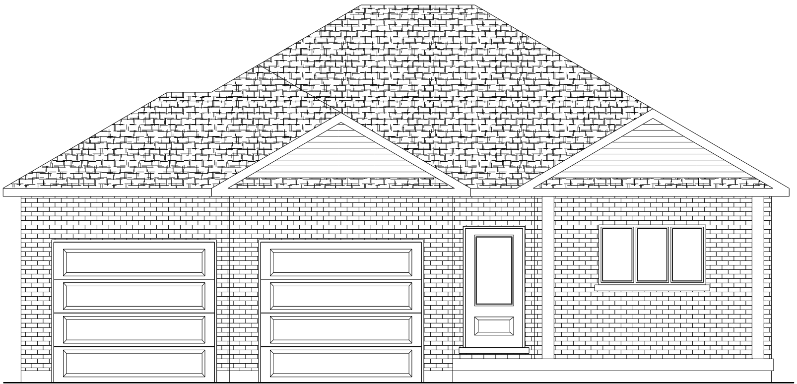
FRONT ELEVATION 'A' THE ELM