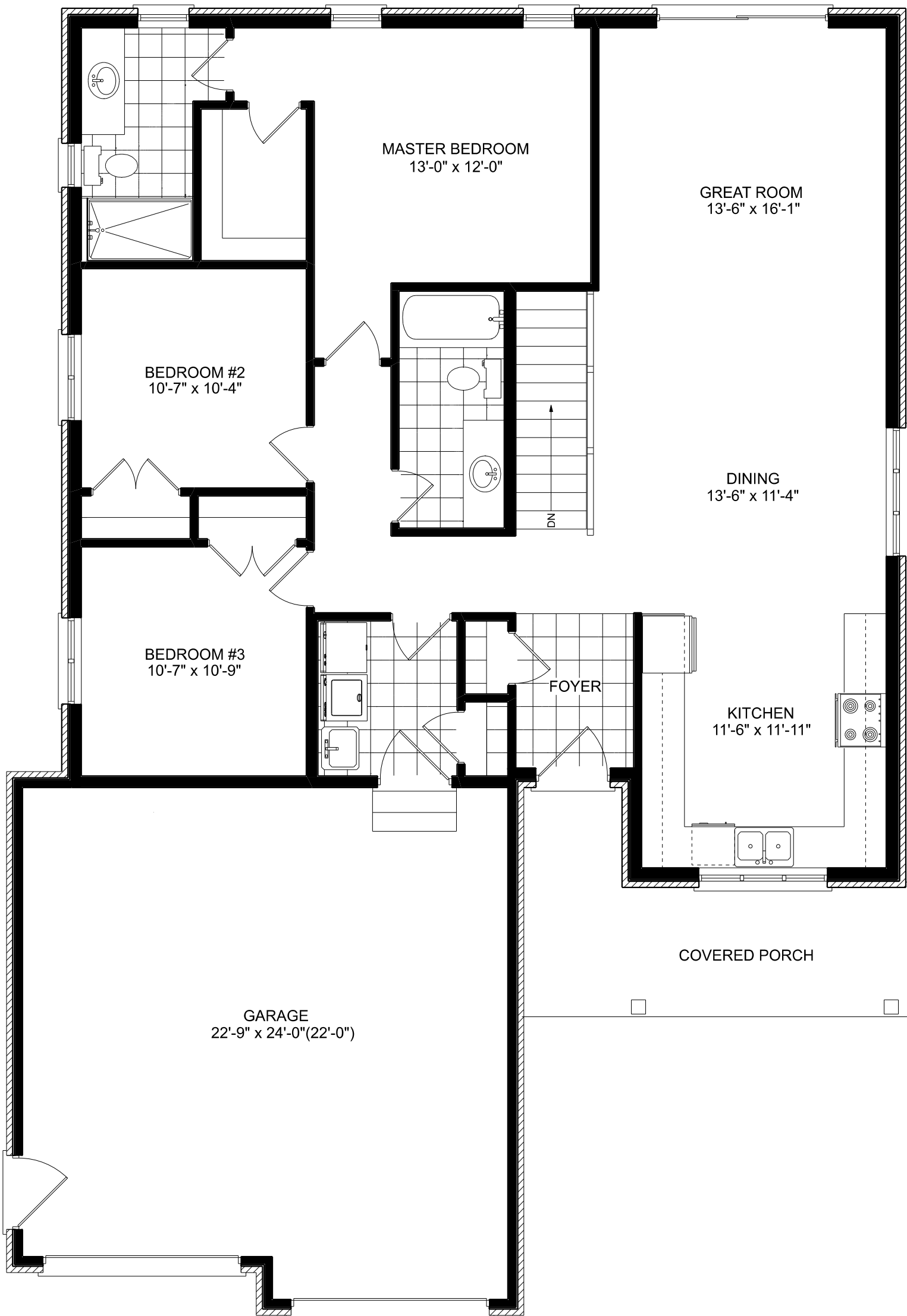
MAIN FLOOR PLAN 1495 SQ.FT. THE ELM